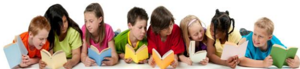
Reading to little people in our local school... Join the Team...